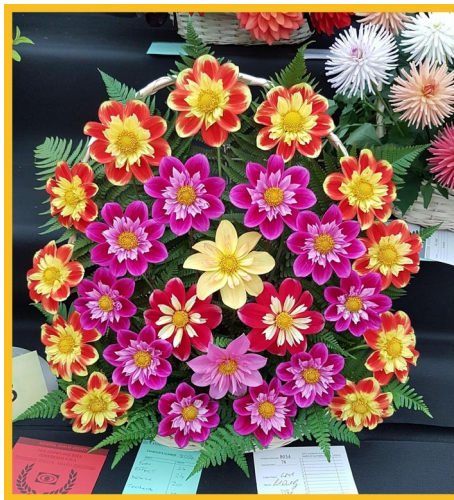
Basket at Harrogate Show

Reg. Charity No. 254049 Website: www.dahlia-nds.co.uk