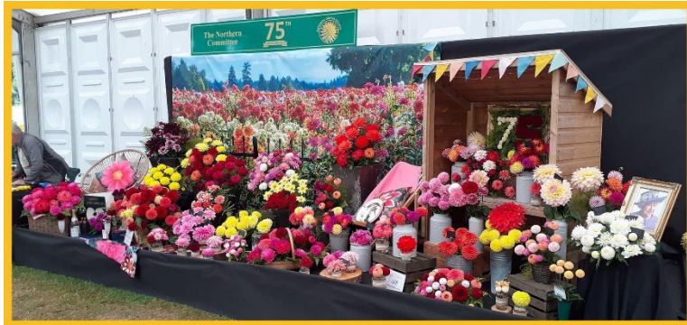
Photo: Northern 75 th Anniversary 2022

Reg. Charity No. 254049 Website: www.dahlia-nds.co.uk